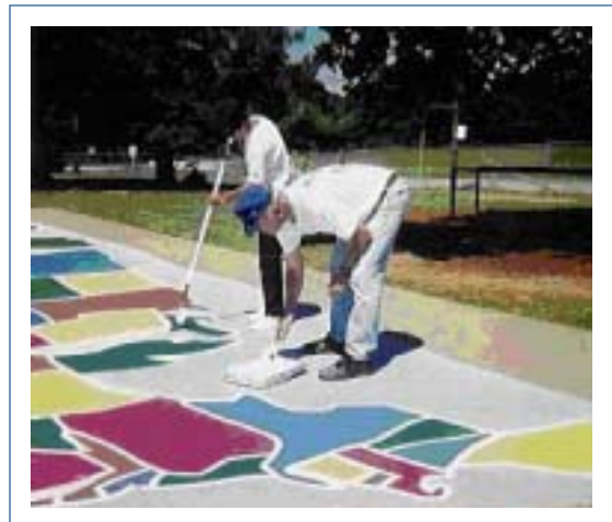
Pioneers working on Playground Maps