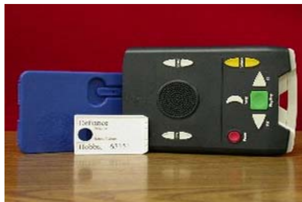
Digital Talking Book player and cartridge