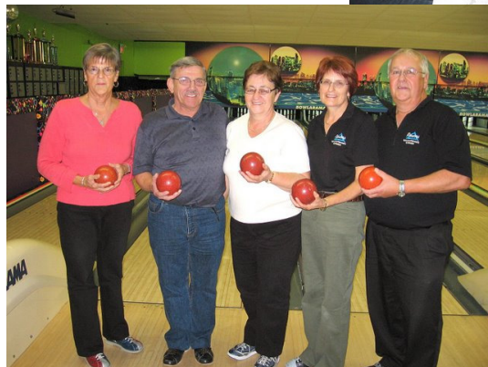
Top Team Winners